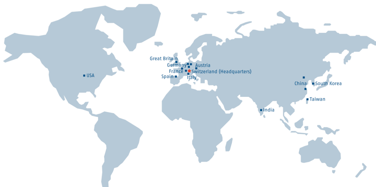
Some training facilities

All NUM technical centres are equipped to provide training. These sessions will either take place in our premises or in your facility.