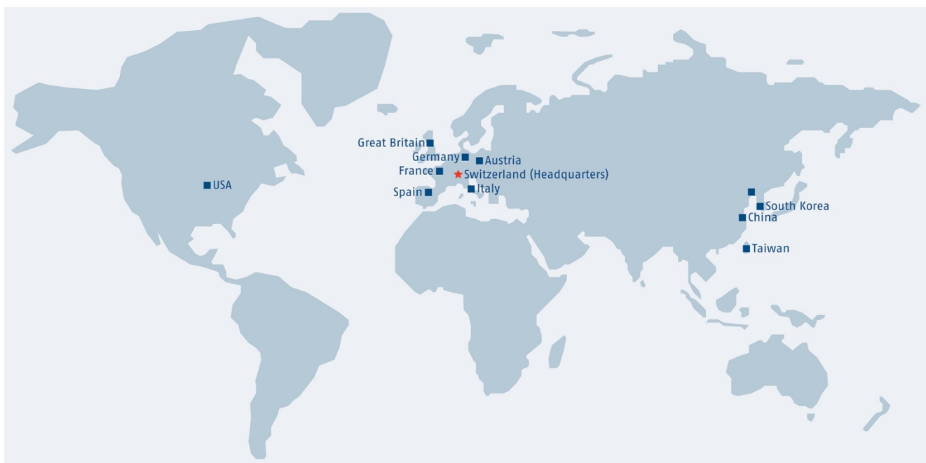
Some training facilities

All NUM technical centers are equipped to provide training. These sessions will either take place in our premises or in your facility.